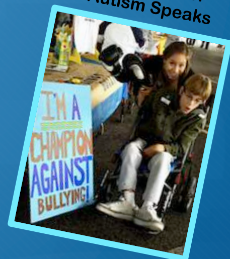
Walk Now for Autism Speaks