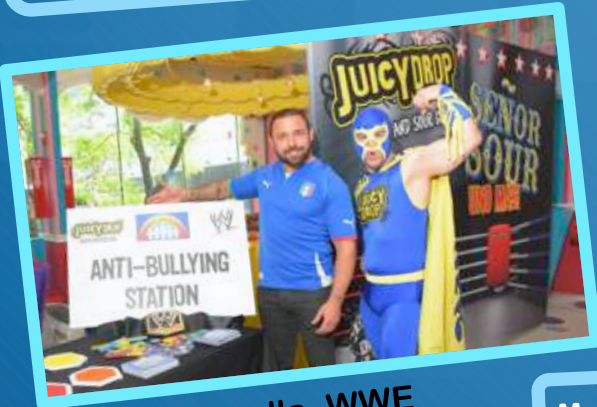
Santino Marella, WWE Bazooka Dylan's Candy Bar NYC