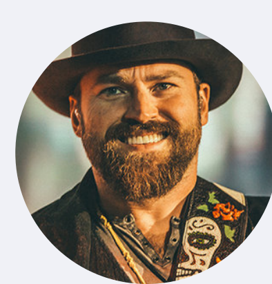
Zac Brown, Singer & Songwriter